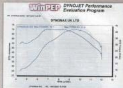
The dyno print out from Dynamax in Horncastle showing the all-important torque curve.