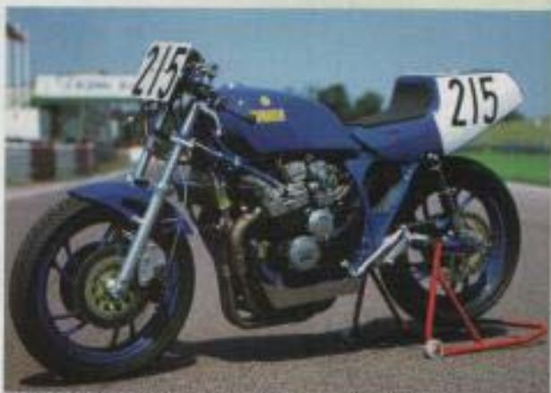
Later FZ600 Yamaha parts have been fitted including the cylinder head.

LEFT: The frame has been strengthened according to the rules and seat and tail unit is from a TZ racing Yamaha. Looks the business all right.